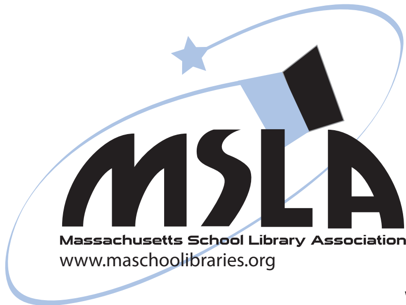
EXHIBIT INFORMATION PACKET

2009 ANNUAL CONFERENCE OCTOBER 4-5, 2009