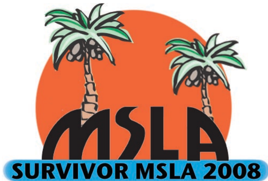
EXHIBIT INFORMATION PACKET

STURBRIDGE HOST HOTEL & CONFERENCE CENTER STURBRIDGE, MASSACHUSETTS