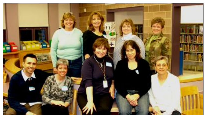
2009 Judging Panel was a Festival of Authors & Illustrators: